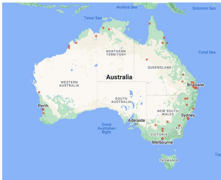
Figure 1 The distribution of pearl millet ( Cenchrus americanus ) in Australia from the Australasian Virtual Herbarium ( https://avh.ala.org.au/ )