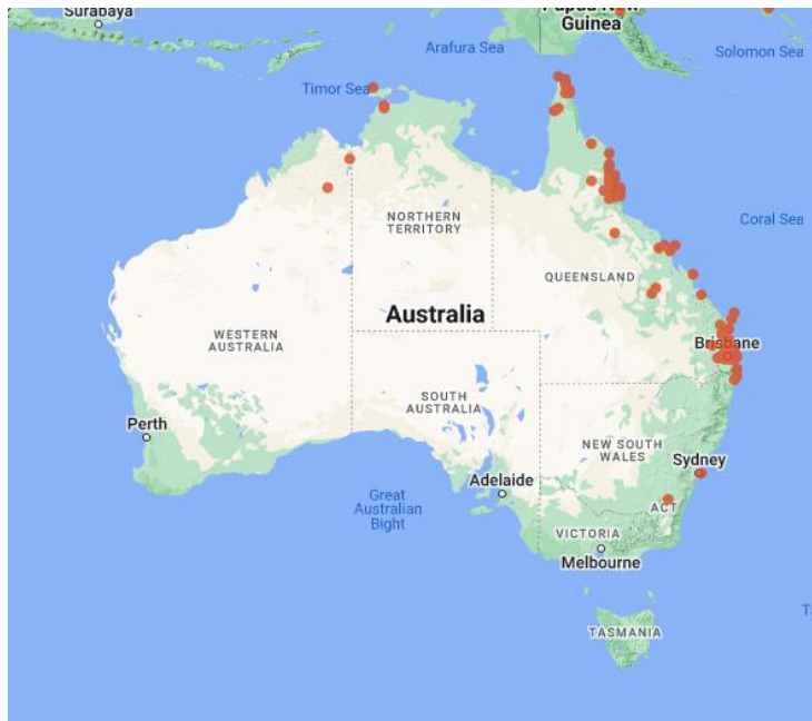
Figure 1 Distribution of signal grass ( Urochloa decumbens ) in Australia

Signal grass is a creeping, tropical perennial grass which can form a dense sward.