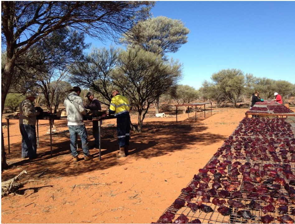
Melangata Bait Rack May 2015

The MRBA community baiting program operates on the basis that a co-ordinated approach, where all pastoralists lay baits within the same time frame, is a fundamental component of a successful wild dog reduction program. Further details of the community baiting program are available in the MRBA Wild Dog Management Plan.