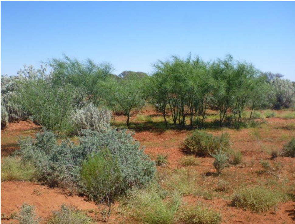
Parkinsonia aculeate - Windimurra Station March 2015

term and over the next three years. Whilst it is too early to determine the effectiveness of the treatment early signs are encouraging.