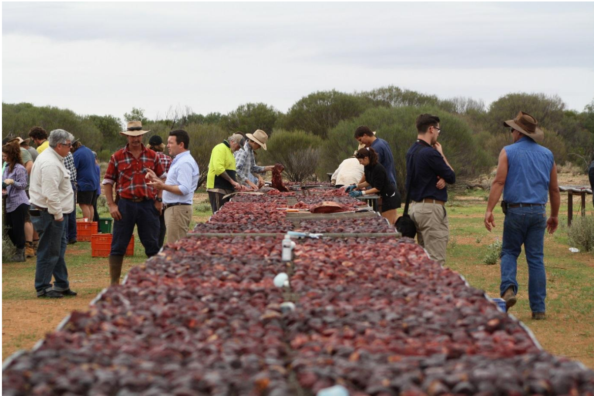
Senator Dean Smith – Challa Bait Racks April 2015

some $4.8 M. Once completed the cell will enclose an area of 88,000 km 2 , helping to protect some 55 pastoral stations and 9 Department of Parks and Wildlife properties.