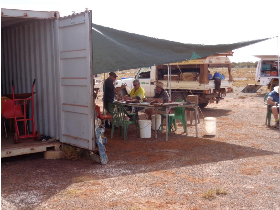
Illgararie Bait Racks September 2017

The MRBA community baiting program operates on the basis that a co-ordinated approach, where all pastoralists lay baits within the same time frame, is a fundamental component of a successful wild dog reduction program. Further details of the community baiting program are contained in the MRBA Wild Dog Management Plan which is available on request.