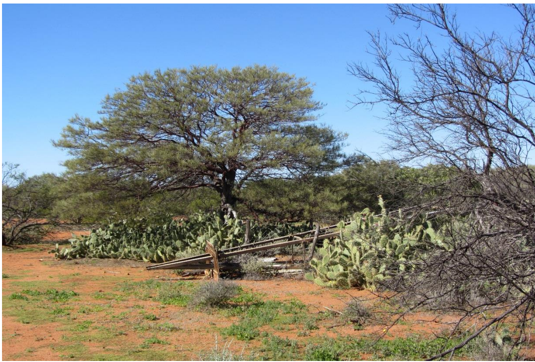
Opuntia engelmannii – Old Woogalong Homestead