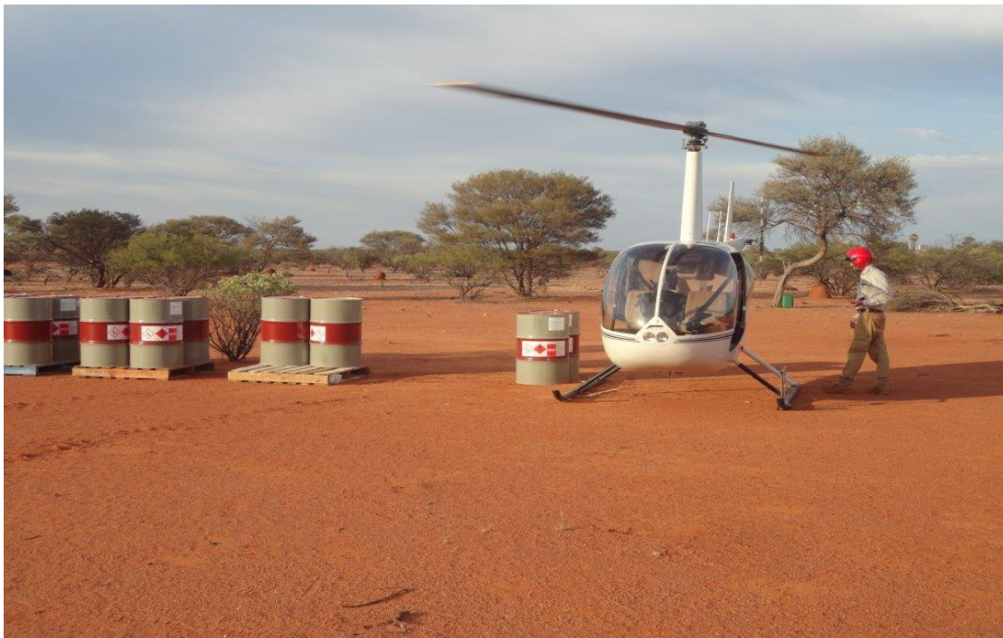
LFH Aerial Operations