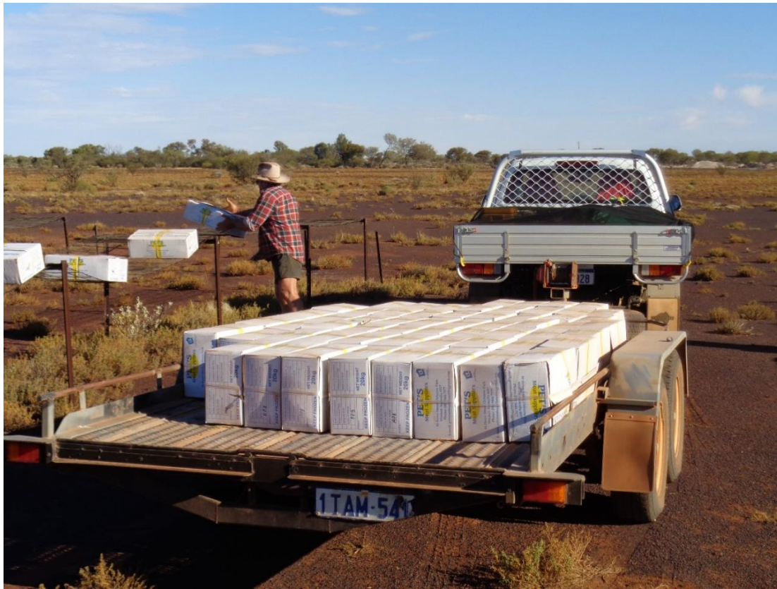
Delivery of Bait Meat - Illgararie

fundamental component of a successful wild dog reduction program. Further details of the community baiting program are contained in the MRBA Wild Dog Management Plan which is available on request.