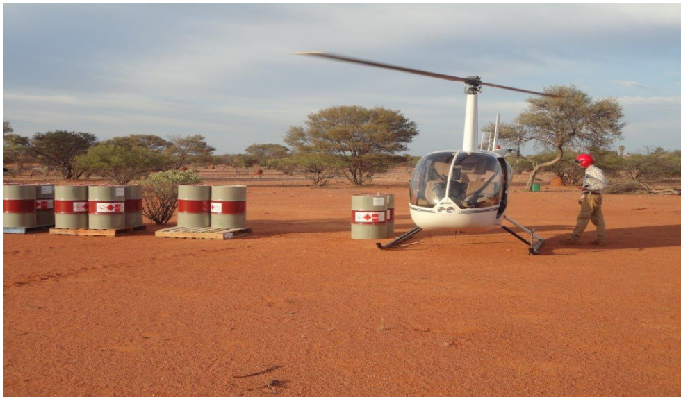
Refuelling at Meka Station

MRBA culls are carried out in accordance with the Invasive Animals CRC Model Code of Practice for the Humane Control of LFHs.