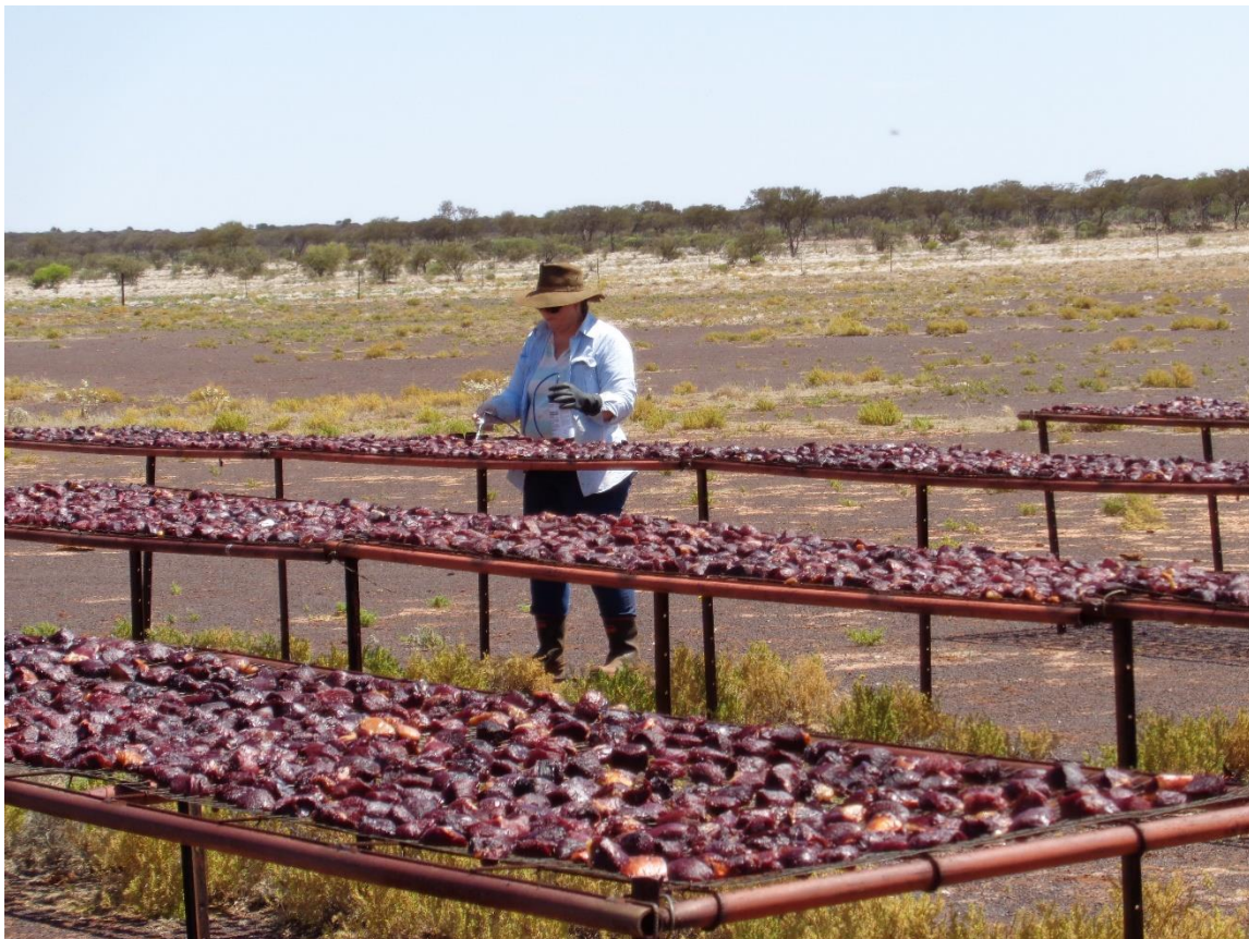
Illgararie Bait Racks

The MRBA community baiting program operates on the basis that a co-ordinated approach, where all pastoralists lay baits within the same time frame, is a fundamental component of a successful wild dog reduction program. Further details of the community baiting program are contained in the MRBA Wild Dog Management Plan which is available on request.