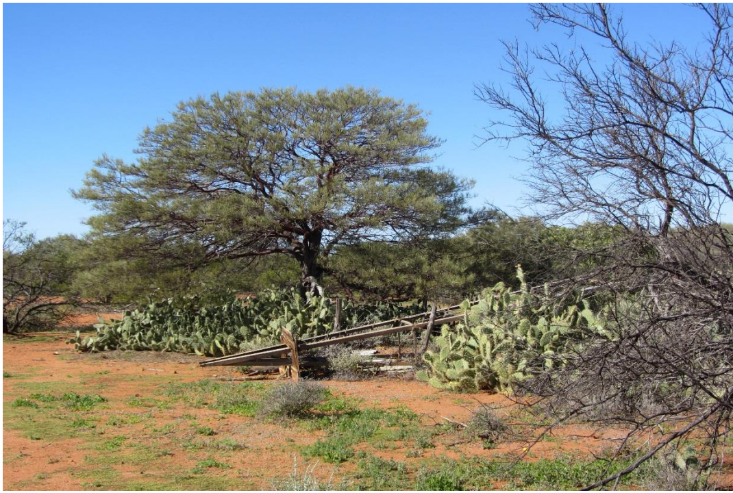
Opuntia engelmannii – Old Woolalong Homestead

headwaters of the Greenough River. The mapping was completed in April 2019 and spraying of the infestation is in progress.