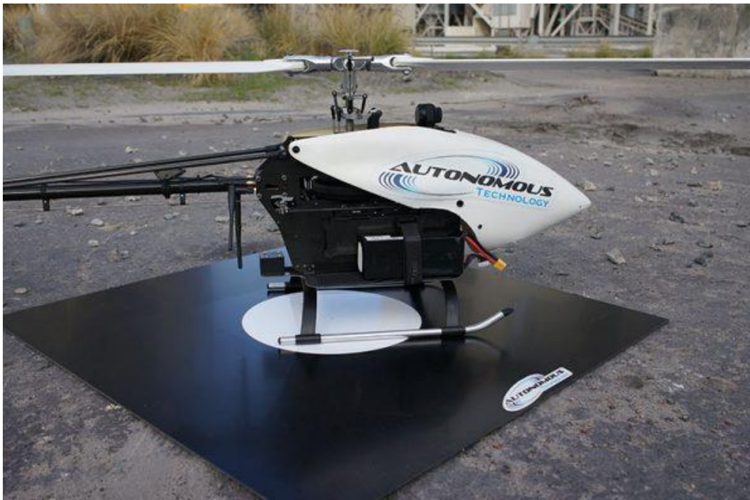
The drone used for mapping at Jingemarra Station