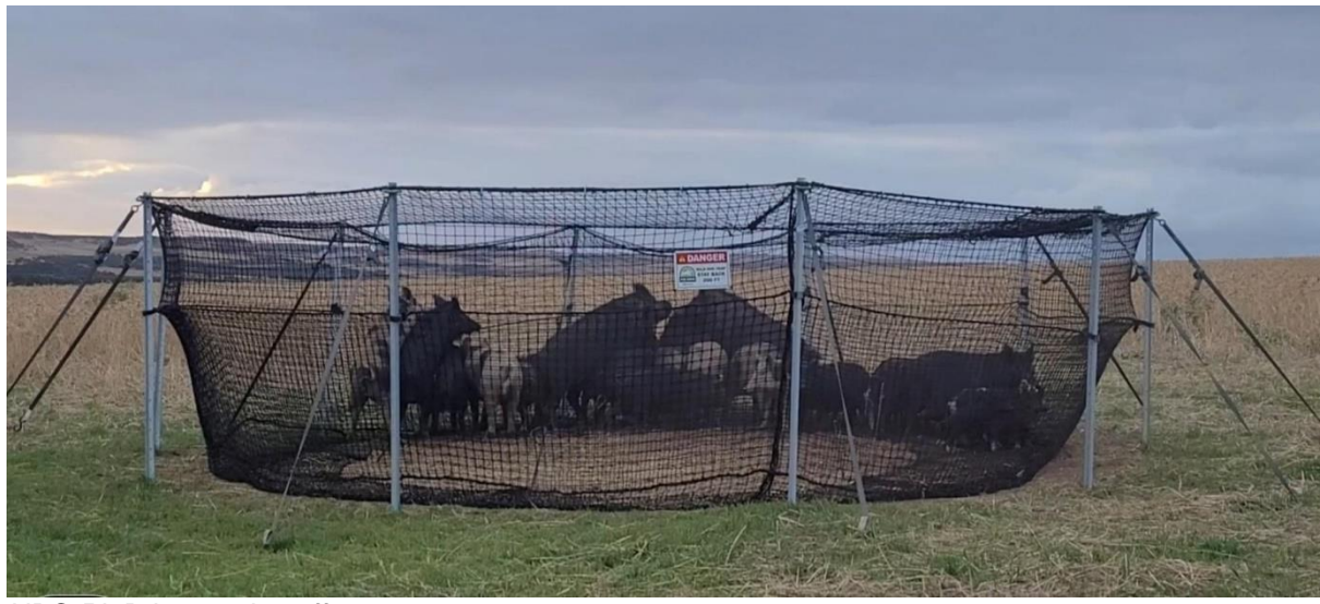
NBG PigBrig trapping effort

The NBG has also purchased four Hoggone Boxes for landholders who don't want or are not allowed to use 1080 on their properties. Mixed findings have been reported and more trials and use is needed to determine if Hoggone is a useful tool in feral pig control in our region.