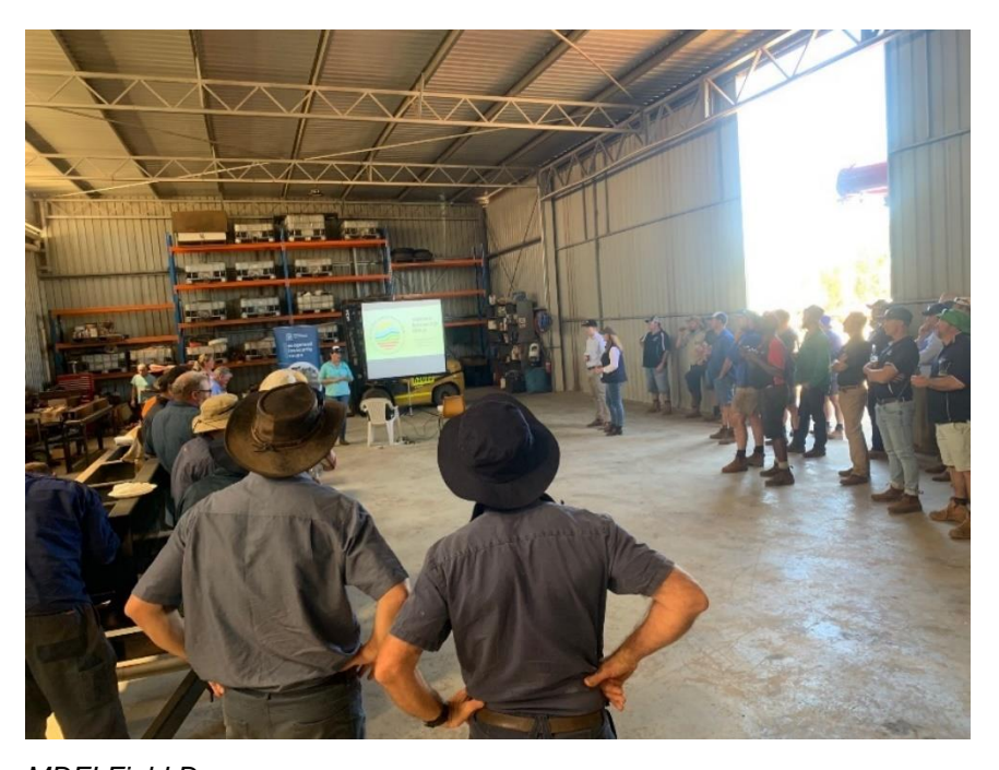
MDFI Field Day

You can find our Membership Form and Constitution on our website: www.nbg.org